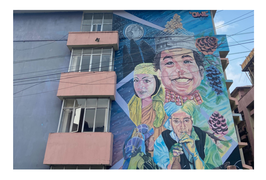
Dispatches from the field - 2023 assembly elections Source: Poulomi Ghosh , TCPD Archives

Photographs from the field by the Centre's staff or its collaborators