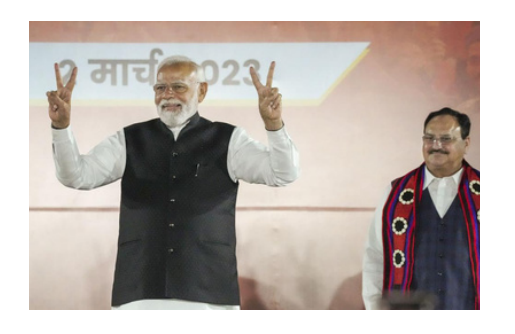
Tripura poll results, in 28 charts: Slim victory for BJP as Opposition holds ground

GILLES VERNIERS, SRISHTI GUPTA, POULOMI GHOSH, ANANAY AGARWAL & PUNEET ARYA