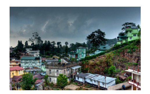
Youth In Politics: Symbolism Or Reality In Meghalaya?

Articles written by members of the TCPD team for the public