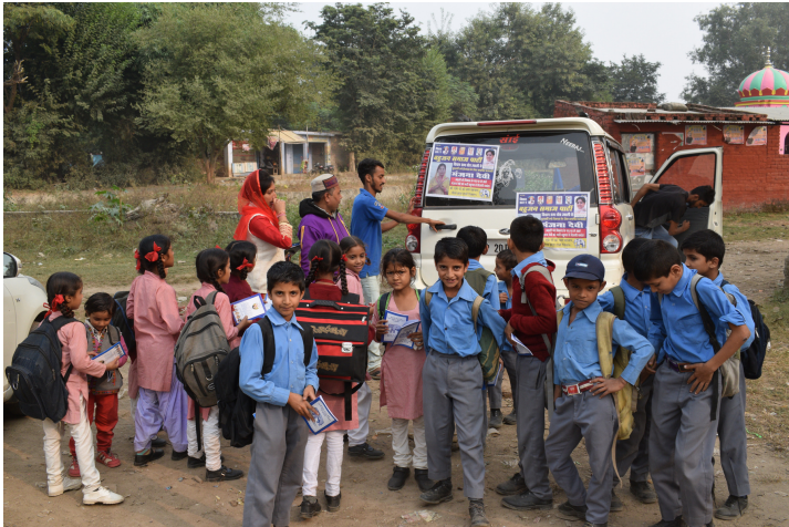
Dispatches from the field - 2017 Himachal Pradesh assembly elections Source: Bassim-u-Nissa , TCPD Archives

Photographs from the field by the Centre's staff or its collaborators