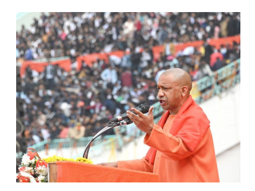
Opportunism and Discontent: Party Hoppers in UP Politics