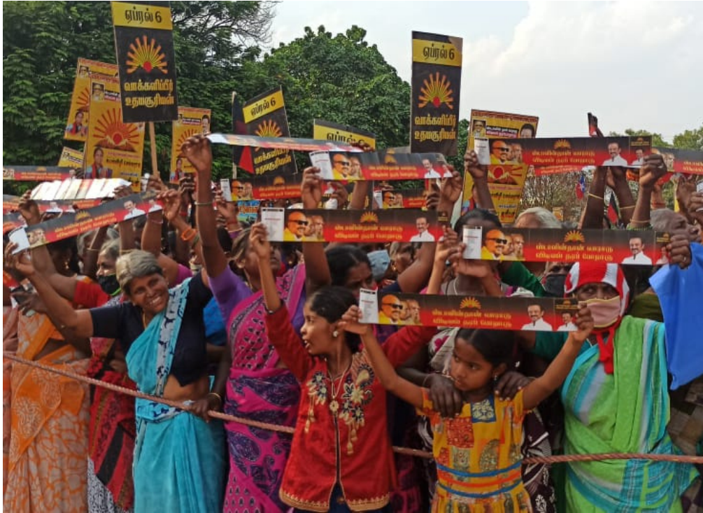
Tamil Nadu State Elections, 2021