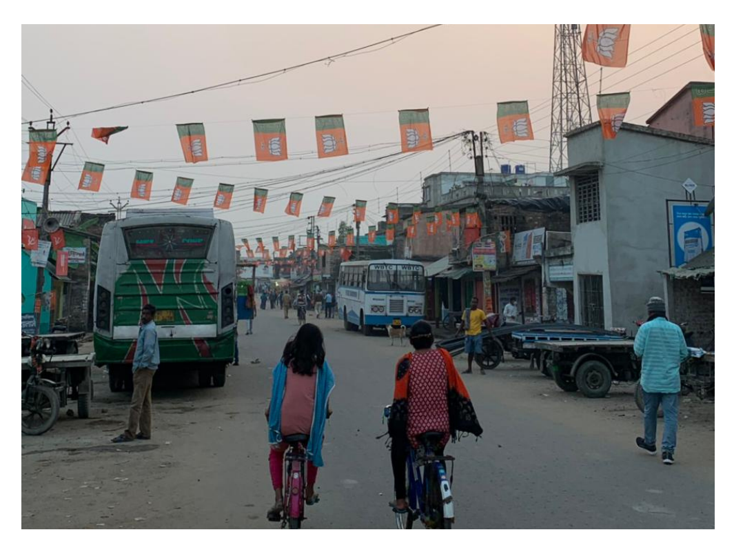
West Bengal State Elections, 2021