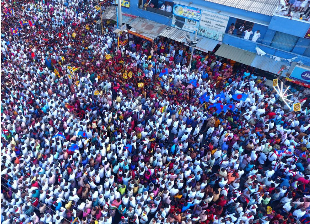
State Elections 2021, Tamil Nadu