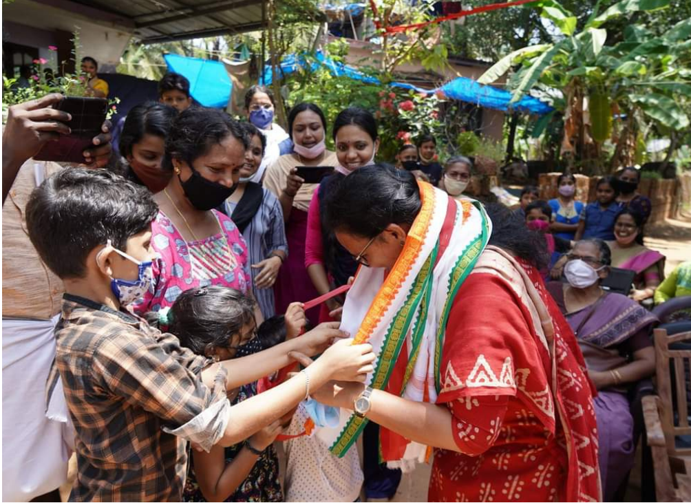
State Elections 2021, Kerala