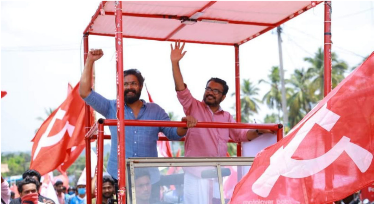
CPI (M) rally, 2021 Kerala Vidhan Sabha elections