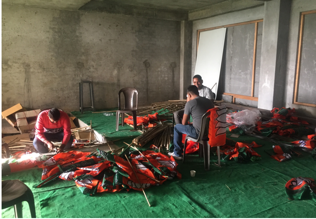
BJP Office, Bhoranj, Himachal Pradesh