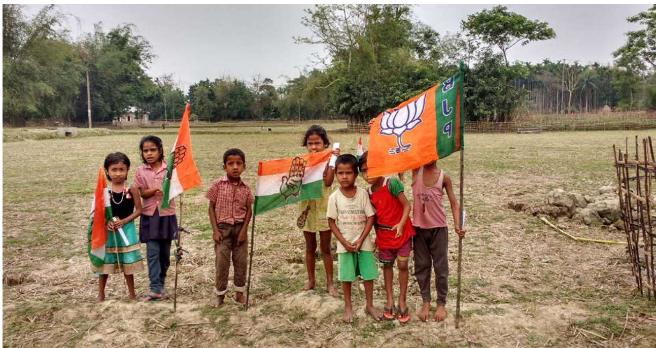
Field work in West Bengal

manual coding and various layers of data verification.