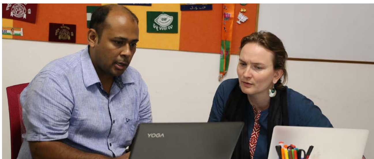
Summer School 2017