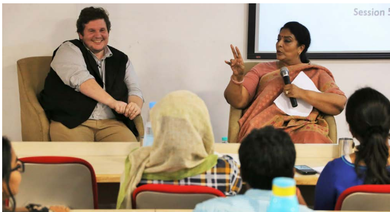
Mrs. Renuka Chowdhury at Ashoka, March 2018