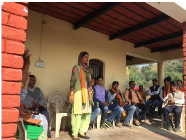
Individual Incumbency Project