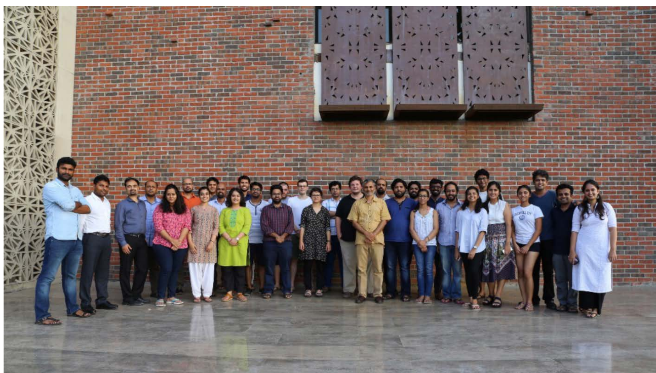
Summer School 2017