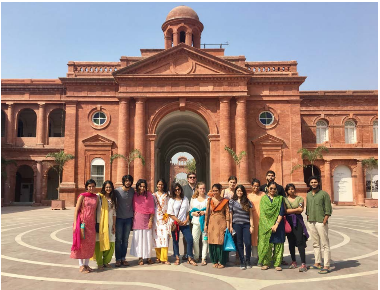
Partition Museum, Amritsar, October 2017