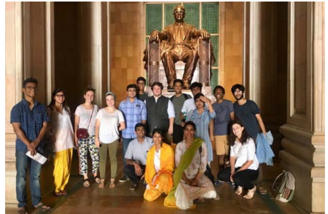
Ambedkar Memorial, Lucknow, April 2018