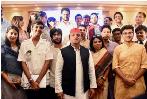
Ambedkar Memorial, Lucknow, April 2018