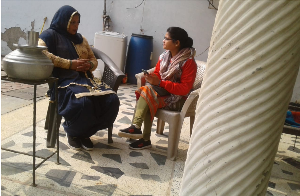
Haryana Sarpanch Survey Courtesy TCPD Archives, October 2019